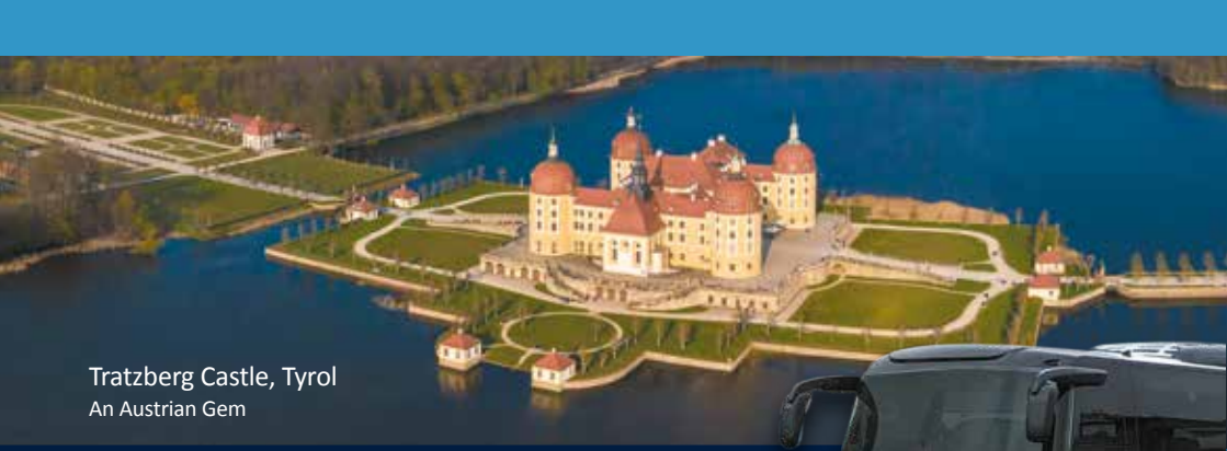
Tratzberg Castle, Tyrol An Austrian Gem